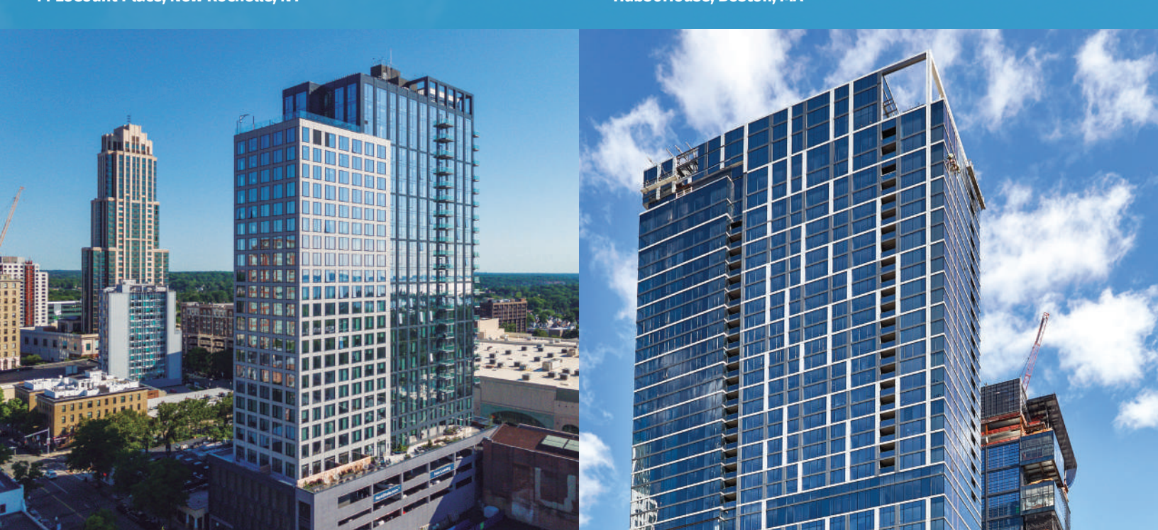
Hub50House, Boston, MA