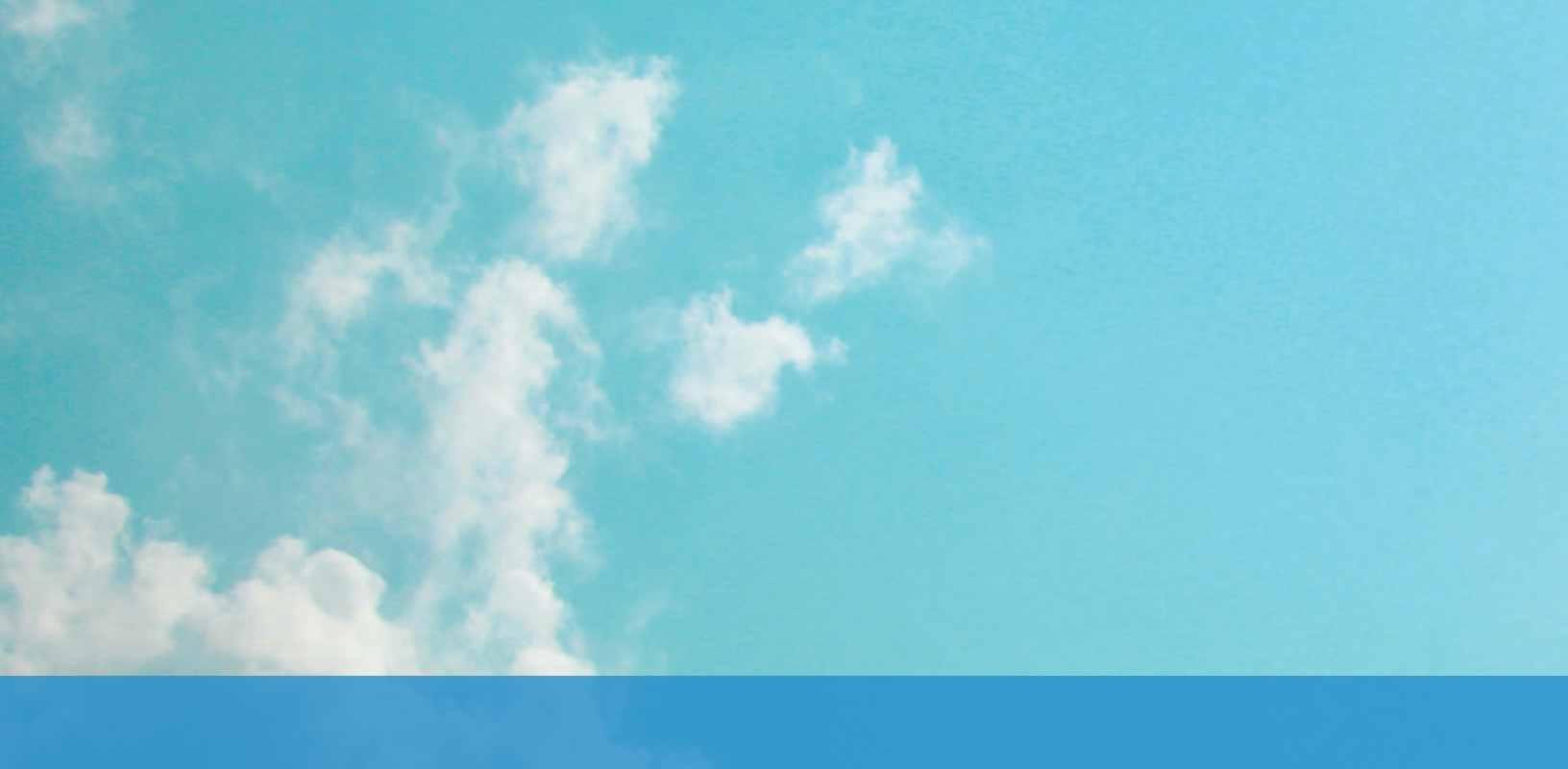
14 LeCount Place, New Rochelle, NY